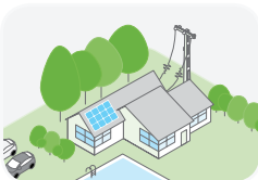
Residential grid-tie solar with backup power